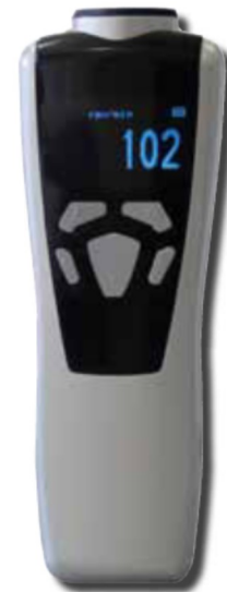
DT-2100 Data-Logging Laser Tachometer