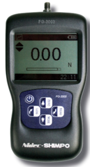
FG-3000 Digital Force Gauge