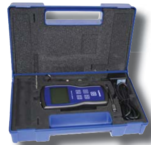
FG-7000 with Accessories in Protective Carrying Case