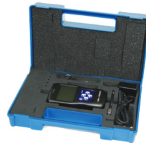
FG-3000 with Accessories in Protective Carrying Case