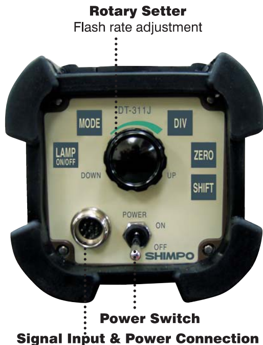
Power Switch Signal Input & Power Connection