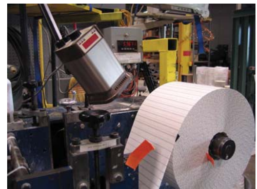
DT-315A Viewing Labeling Machine