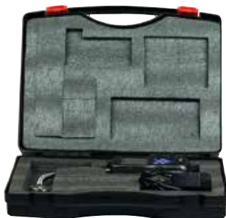
FG-3000R with Accessories in Included Carrying Case