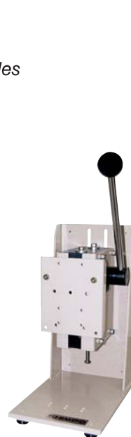
FGS-50S Lever Test Stand