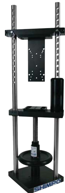
FGS-1000H Hand Wheel Test Stand