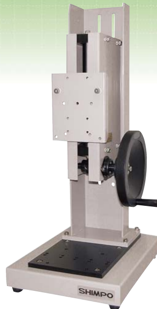
FGS-100H Hand Wheel Test Stand

Nearly all manufacturers' gauges are compatible with Shimpo's test stands for incredible versatility. These stands are designed for precision, balance, and durability. Therefore they are perfectly suited for measuring a limitless range of materials such as, wire, spring, plastic, paper cord, tubing, glass and composites.