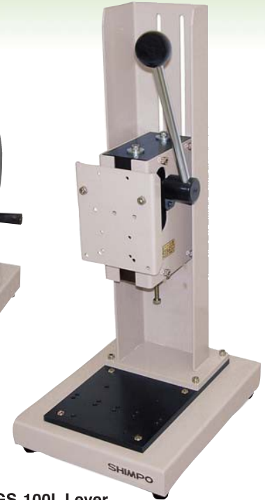
FGS-100L Lever Test Stand