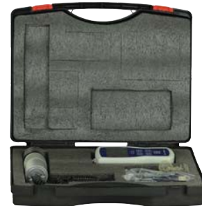
FG-7000T with Included Accessories and Carry Case